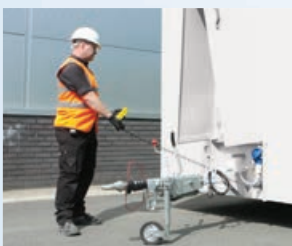
Unhitch from towing vehicle and operate hydraulics using the push button controls

Easily towed, one man operation secured and manoeuvred on site. Its many safety features make it a high secure and money saving choice of welfare unit for rental companies and contractors.