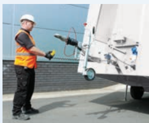
Lower unit to the ground and unplug controls