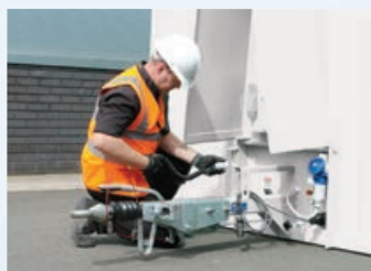
Close & lock canopy to protect towing facility