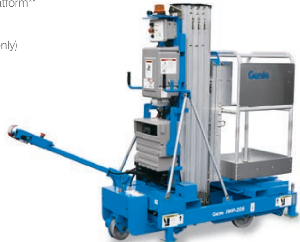
Shown with optional power wheel assist

* Adds 12.5 in (.32 m) to unit length and 285 lbs (129 kg) to unit weight ** Not available with Outreach package